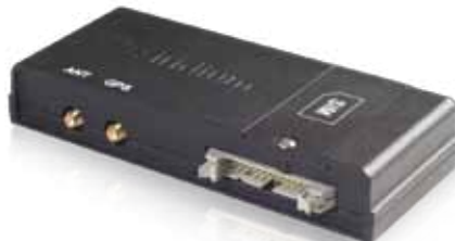
Iridium 9522B voice and data communications