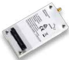
Iridium 9601 SBD data modem

Deployed in mission critical applications today, Iridium devices are thoroughly field-tested under some of the harshest environments known to man – from the frozen Arctic to equatorial deserts, and from high-altitude aircraft to robotic scientific gliders that submerge deep beneath the sea.